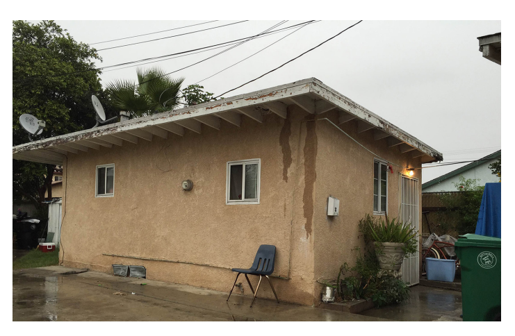
Figure 3. Unpermitted Back House in Lynwood.