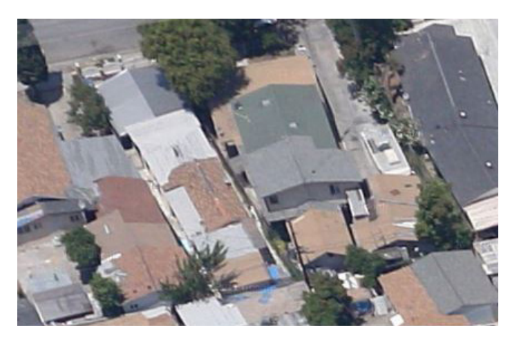
Figure 2. An Example of Unpermitted Housing Covering the Open Space on Residential Lots, Florence-Firestone.